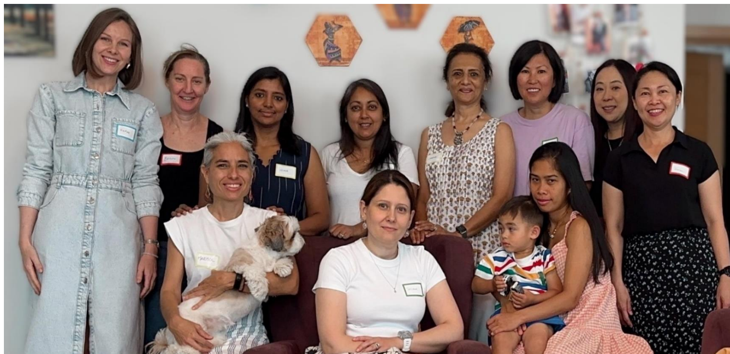
Coffee Morning Brings Community Together in Atyrau – May 2025

A coffee morning is planned for the fall (September) in Atyrau, and the team is looking forward to seeing as many of you as possible then.